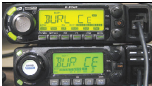
Figure 1 — Compare the ID-880H display with the older ID-800H below. The '880H is wider, a bit more cluttered, but still easy to read. The '880H display can show eight characters compared to the ID-800H's six. The ID-880H has one extra button, but the button labels are printed on the panel and disappear in the dark. The bottom row of icons shows the button's secondary (push and hold) functions.

Price and features will make the ICOM ID-880H a popular VHF/UHF dual band mobile radio with D-STAR digital and analog FM capability built in.