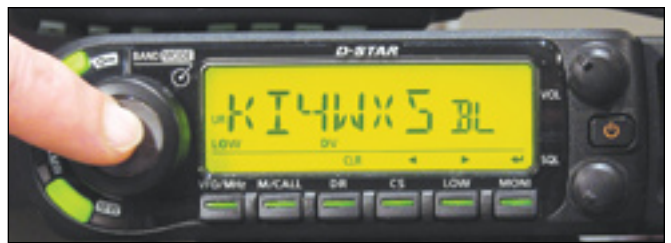
Figure 3 — Here I'm programming the ID-880H. Note the little arrows at the bottom of the display that aid navigation. Also note that the display shows eight characters (with the last two shrunk a bit). This call sign: KI4WXSBL is DPlus shorthand that says "link to the KI4WXS UHF repeater."

done. More instruction would make a long manual even longer, and once you've figured it out, the instructions seem more obvious, but it would ease the pain initially.