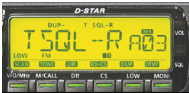
Figure 2 — Selecting a tone mode in the ID-880H. The tone options shows up as big characters, not just tiny icons. This is the new reverse tone squelch mode described in the text.